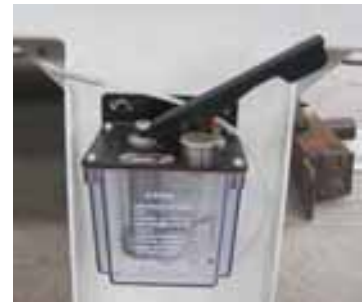
Oil Lubrication System--For Guide Rail