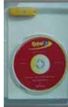
Type3 (Free of Charge)