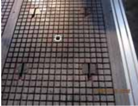
Vacuum Table & Vacuum Pump 5.5KW