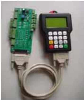
DSP Hand Held Controller--Offline Control