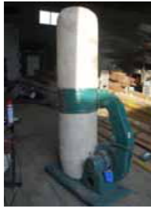
Vacuum cleaner and Brush for Dust Collection